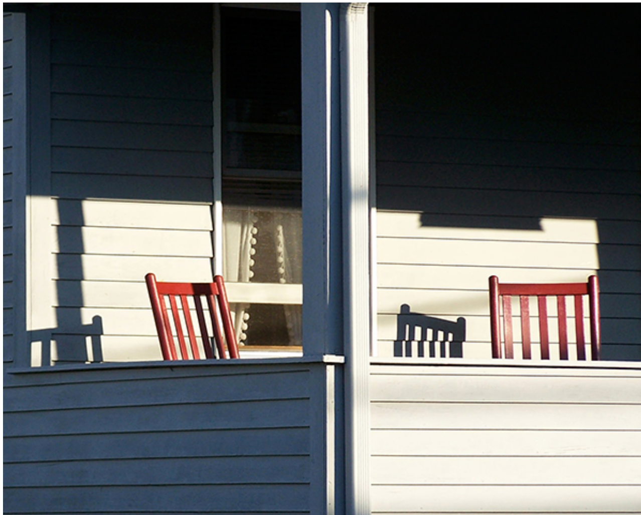
Summer Porch