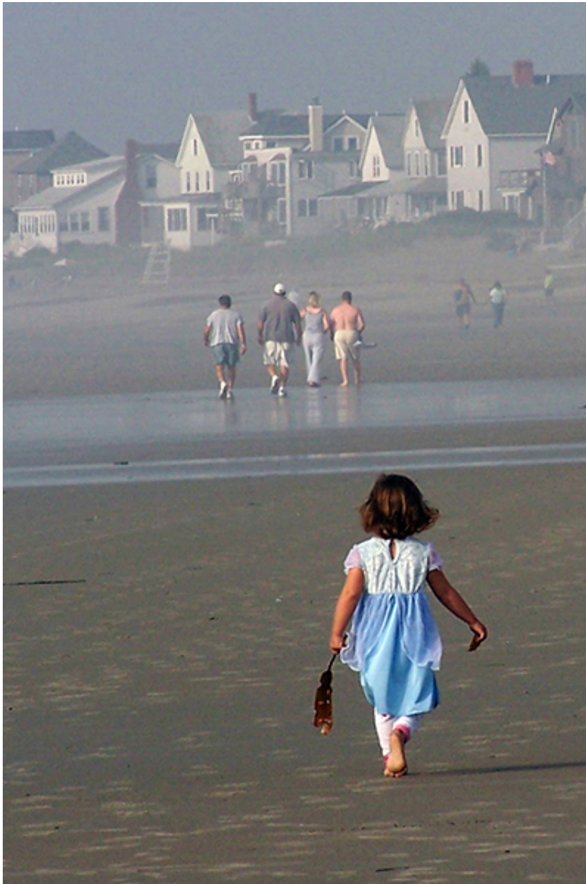
Girl on Beach © Sandra Goroff

All images are available as prints (matt and framing also available) from Solitary Soul. Four of the images are already up for sale on Goroff's website under "Prints" . In addition to the Holiday Exhibition in Sudbury, Goroff is currently planning a two-person show with another artist for a gallery in Kennebunkport, Maine for Spring 2014. More information once available will be posted on her website.