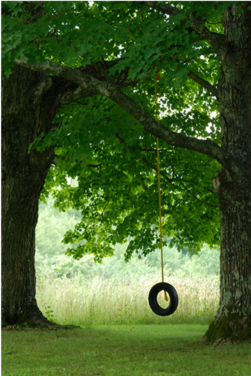
Tire Swing

Goroff studied photography at the Maine Media Workshops with local legend Alison Shaw . While learning the basic fundamentals, aided by mentors to help hone her eye, Goroff focused mainly on composition and tone within her photographs. Goroff creates experiential works referring to the quiet mundane, moments in time often overlooked in everyday life, presented in new light. The summer light cast upon a porch, a little girl running on the beach, an elderly man gazing at his reflection in the street - these are all moments we have experienced yet haven't seen as so.